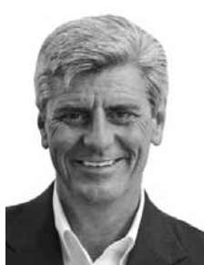
Lt. Governor Phil Bryant (R) Brandon