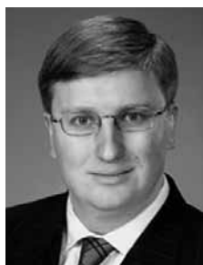
Treasurer Tate Reeves (R) Flowood