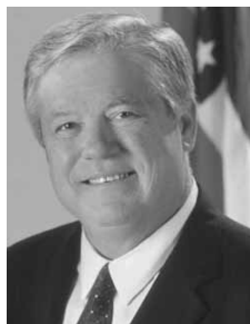
Governor Haley Barbour (R) Yazoo City