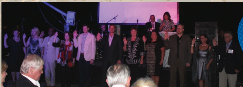
The 2015 MAR Officers and Directors are sworn in at the installation gala.