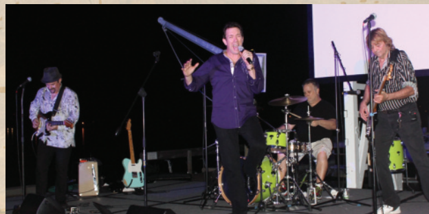
The members danced under the moonlight to the sounds of The New Tropics from St. Petersburg, Florida.